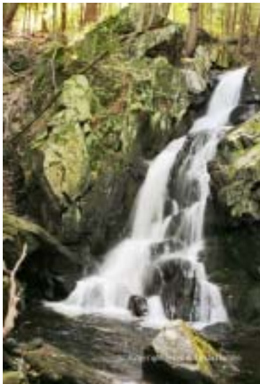
Goldmine Brook Falls