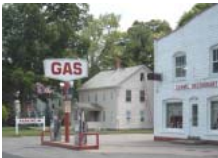
Carm's Restaurant and Gas Station