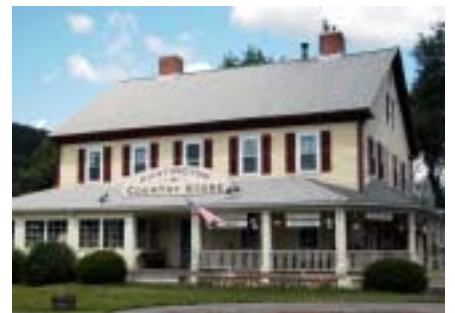
Huntington Country Store

For licensing information please contact :