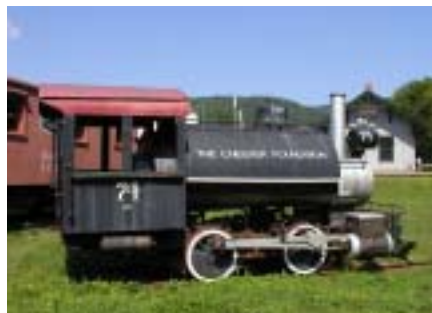
Chester Railroad Depot & Museum