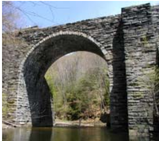
Keystone Arch Bridge