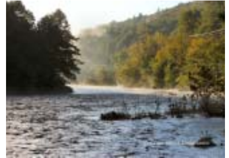
Wild and Scenic Westfield River