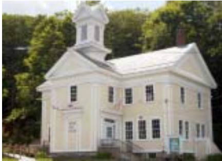
Becket Arts Center

A photo library has been assembled featuring many of the major attractions, activities, and scenic vistas on Jacob's Ladder Trail. These photographs are available for reproduction, pending agreement with individual photographers. The following are just a sampling from the library. Contact information regarding licensing is noted below.