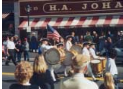
Parade in Lee